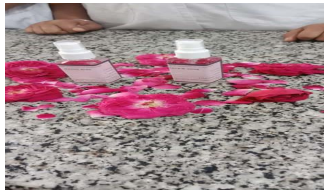
Rose Water Extraction