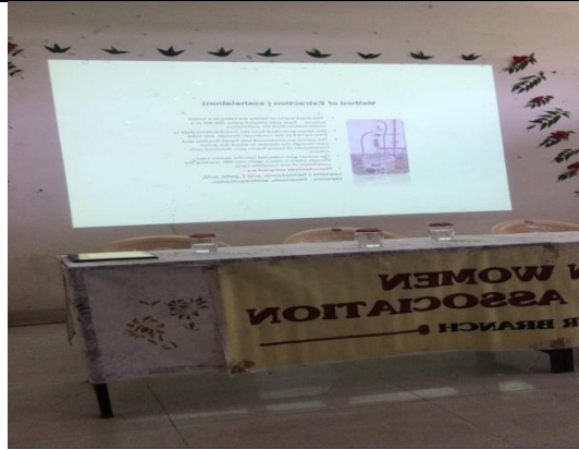
Power point Presentation