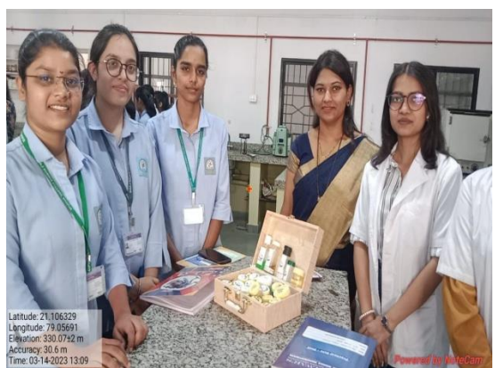
Final Herbal Products