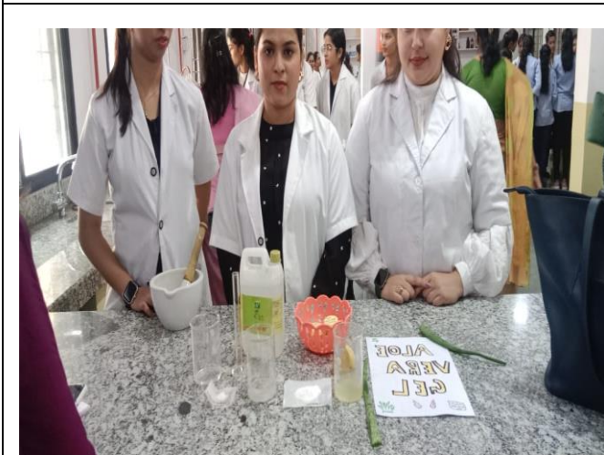
Aloe Vera gel production