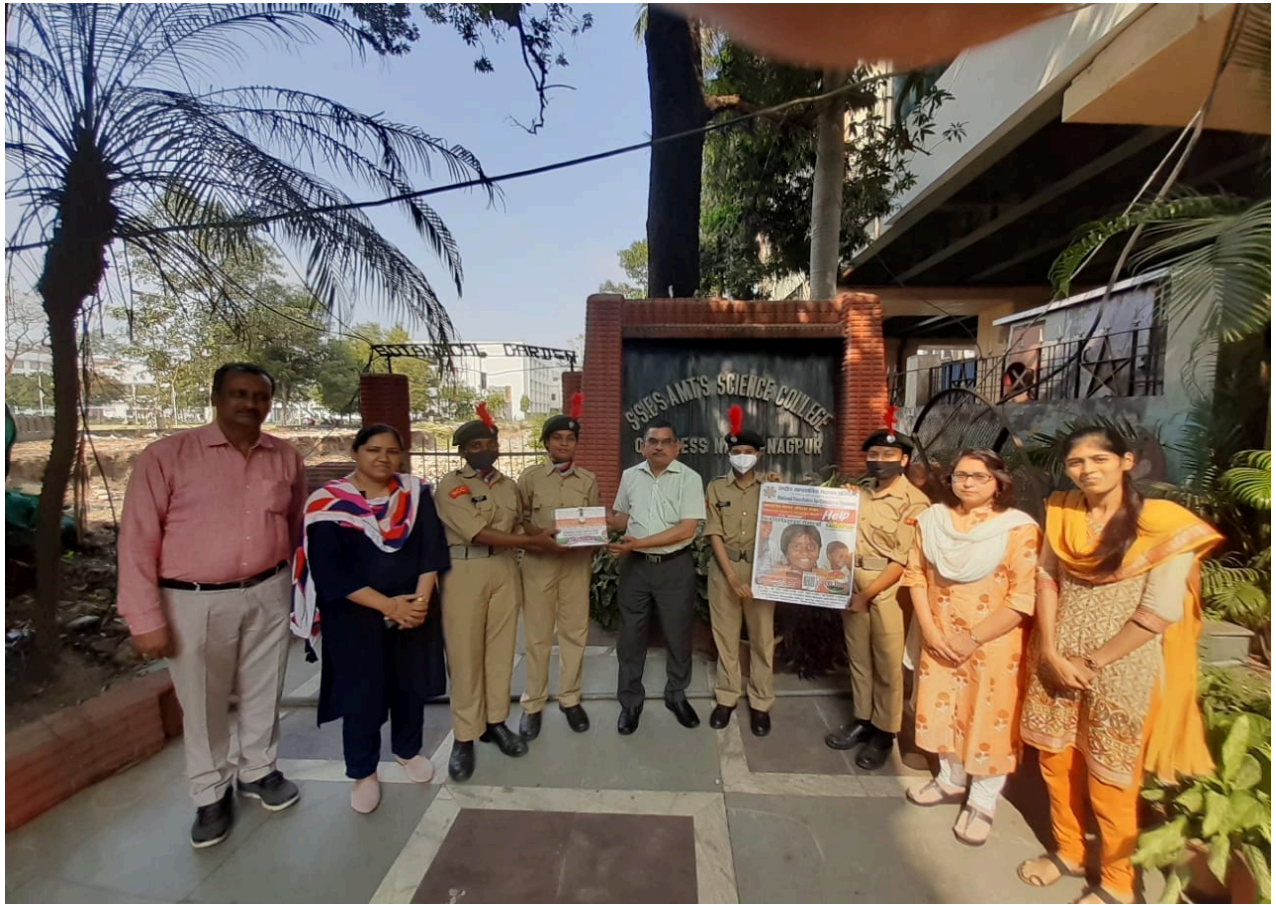
Photograph on Communal Harmony Campaign Week and Flag Day 2021.