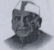
Dr. Panjabrao alias Bhausaheb Deshmukh Founder President