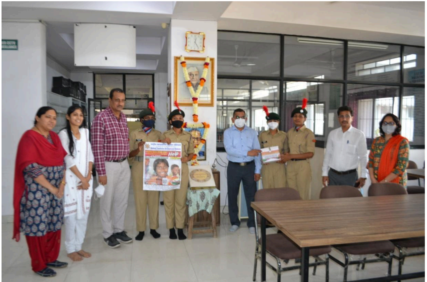
Photograph on Communal Harmony Campaign Week and Flag Day 2021.