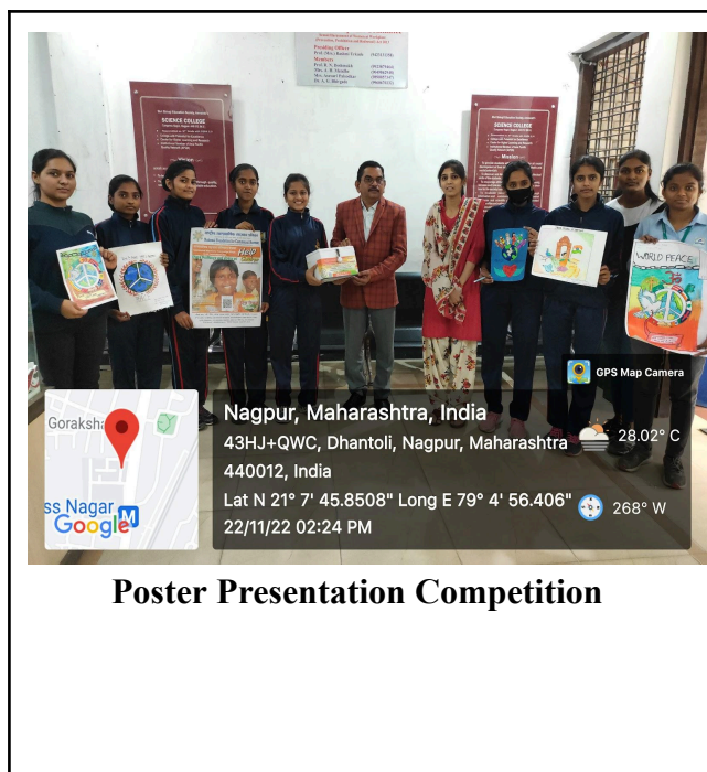
Poster Presentation Competition