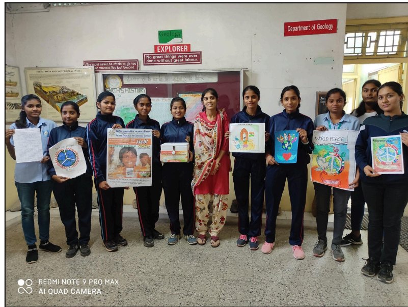
Photograph on Essay, Painting and Seminars competitions on the occasion of Communal Harmony Campaign Week and Flag Day 2022