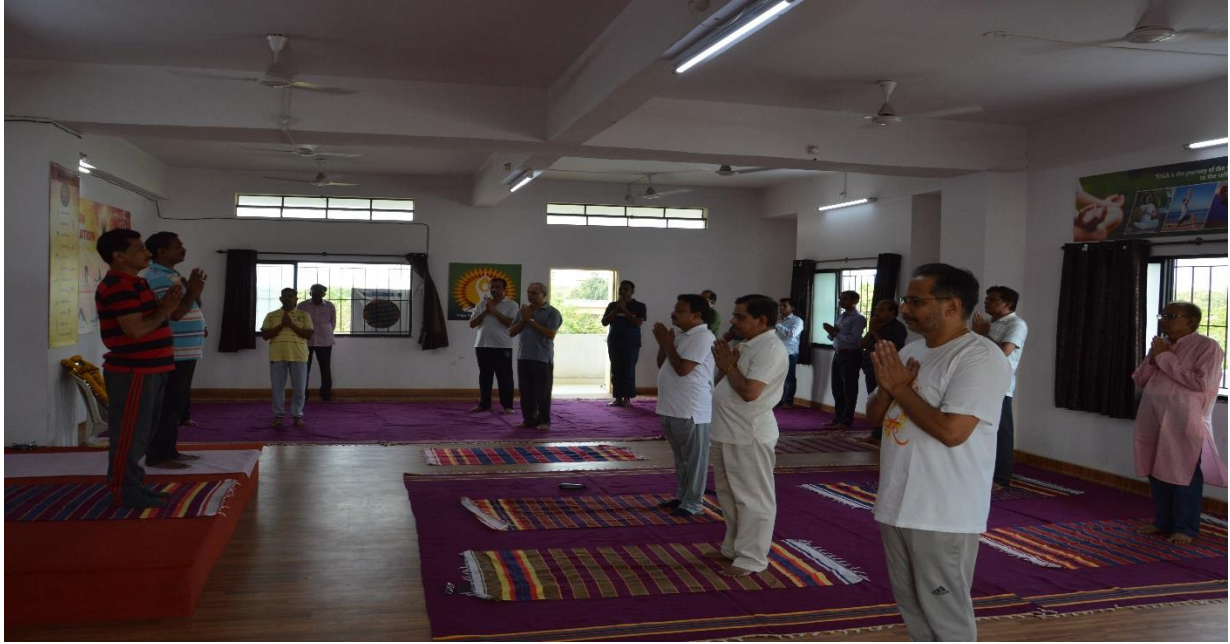
Faculties relaxing before performing yoga