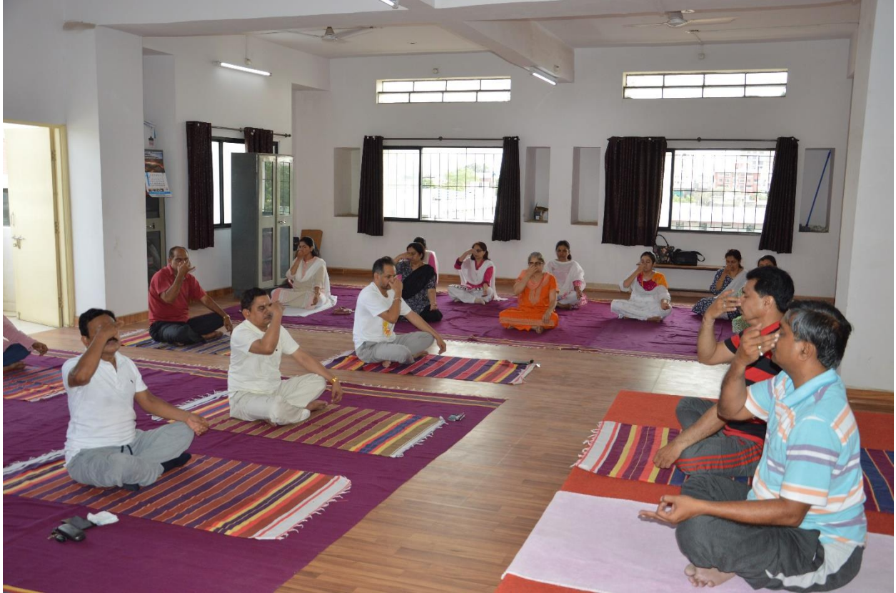
Faculties performing yoga