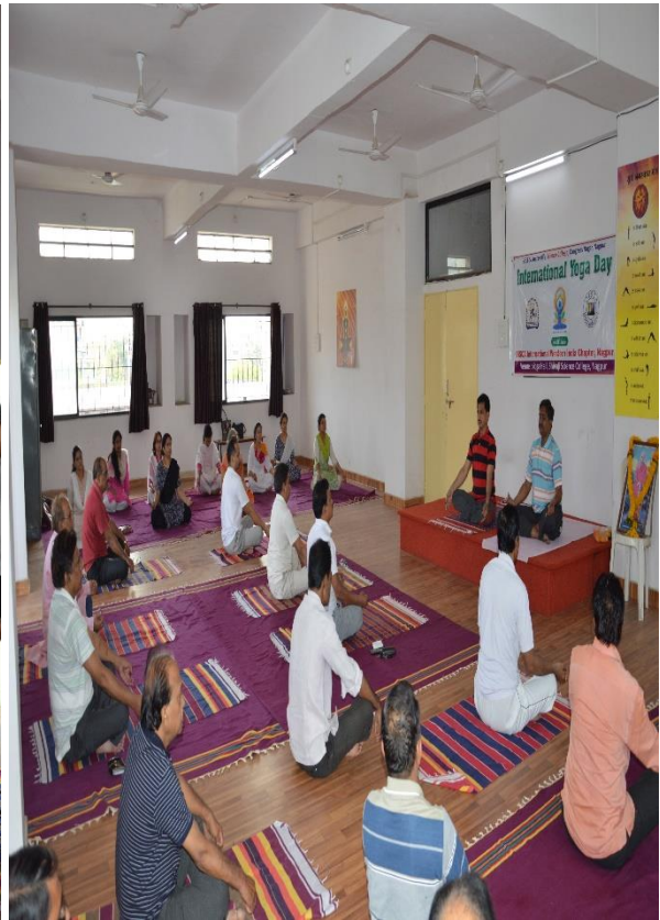
Faculties performing yoga