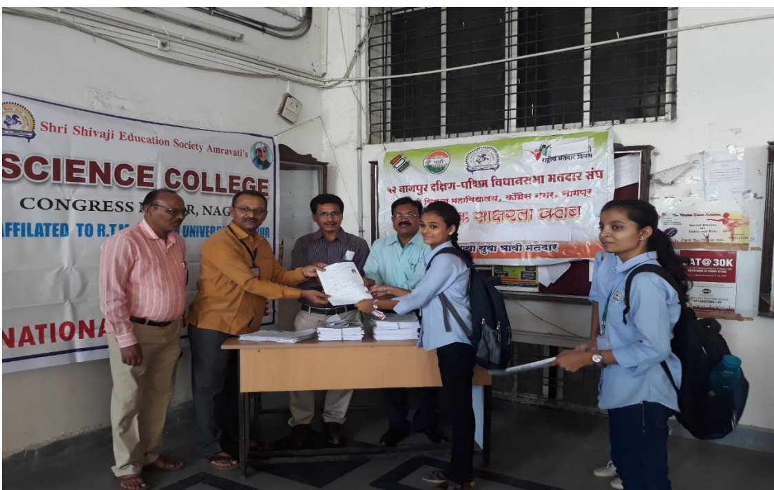
Election Commission Department officials distributing election enrollment form to student