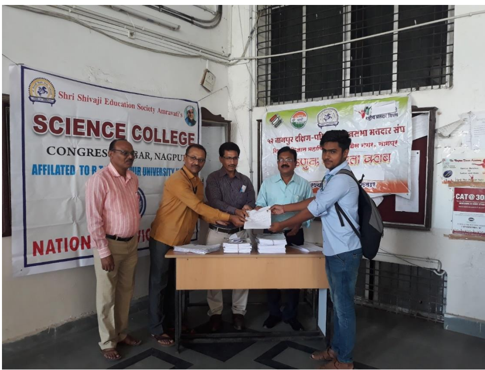
Election Commission Department officials distributing election enrollment form to student