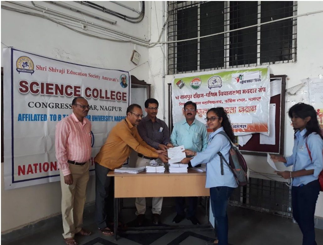
Election Commission Department officials distributing election enrollment form to student