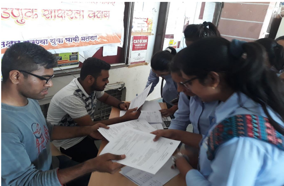
Students collecting forms