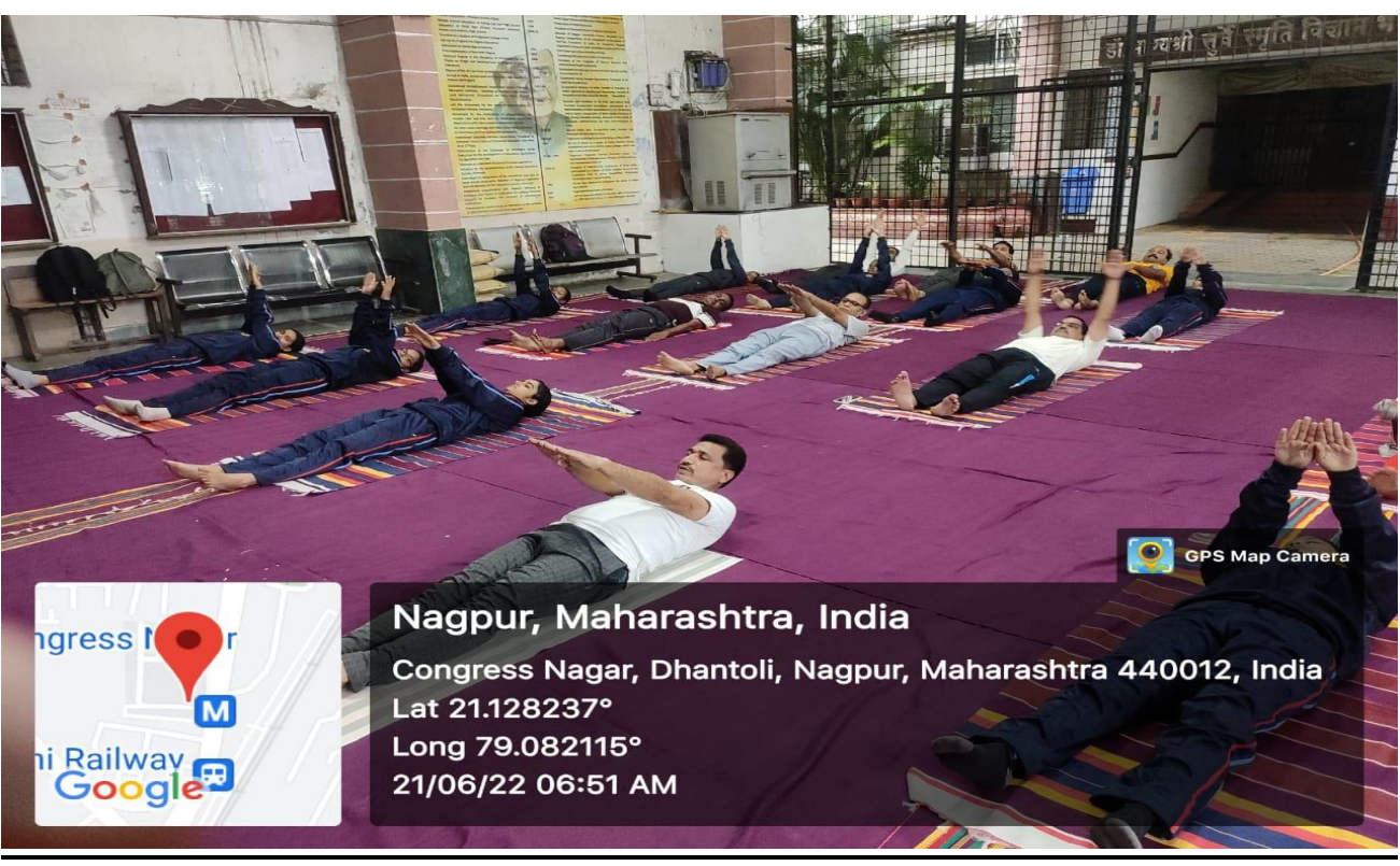
Students and staff doing yoga