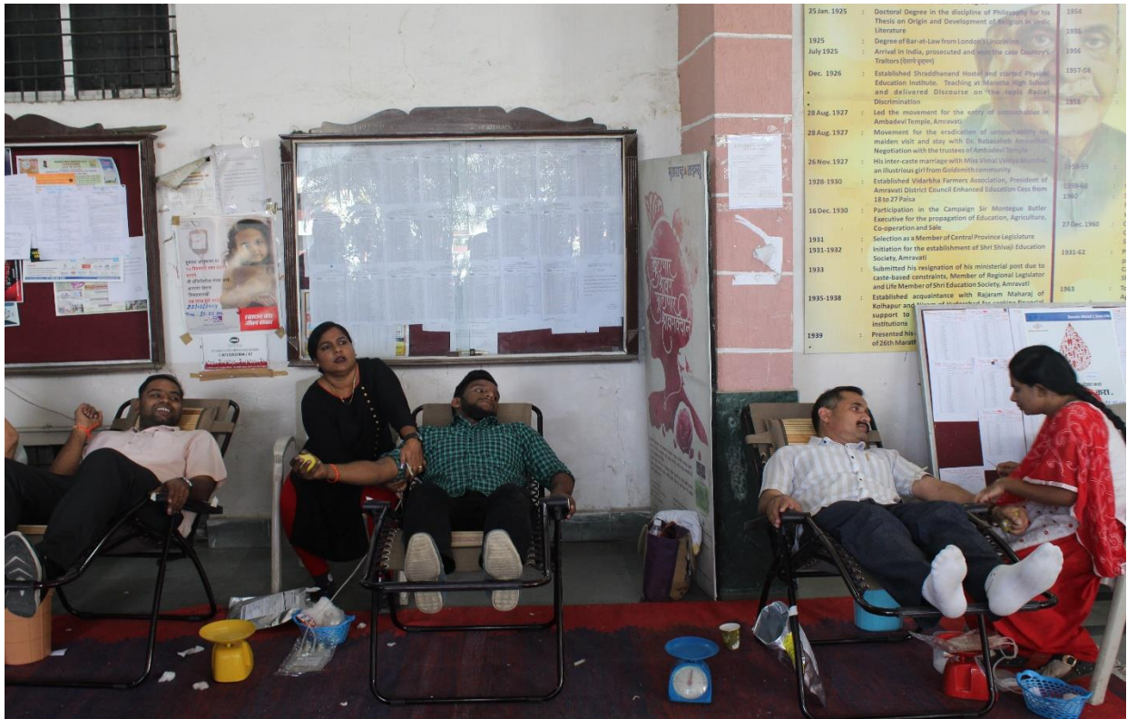
Teachers participating in the event