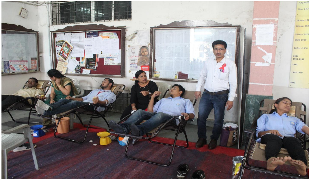
Students and Faculty participating in the Camp