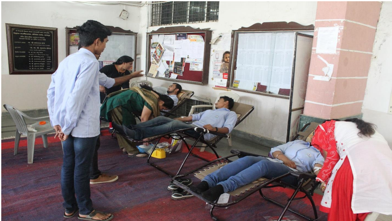
Students participating in the Camp