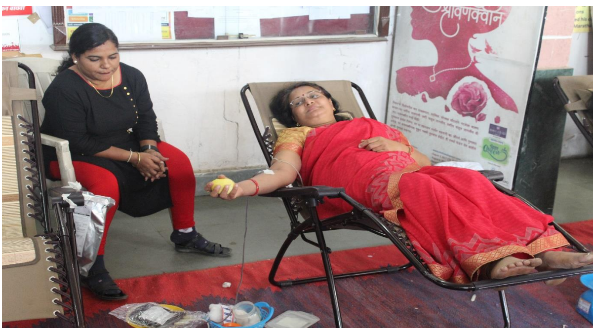
Faculty participation in the event