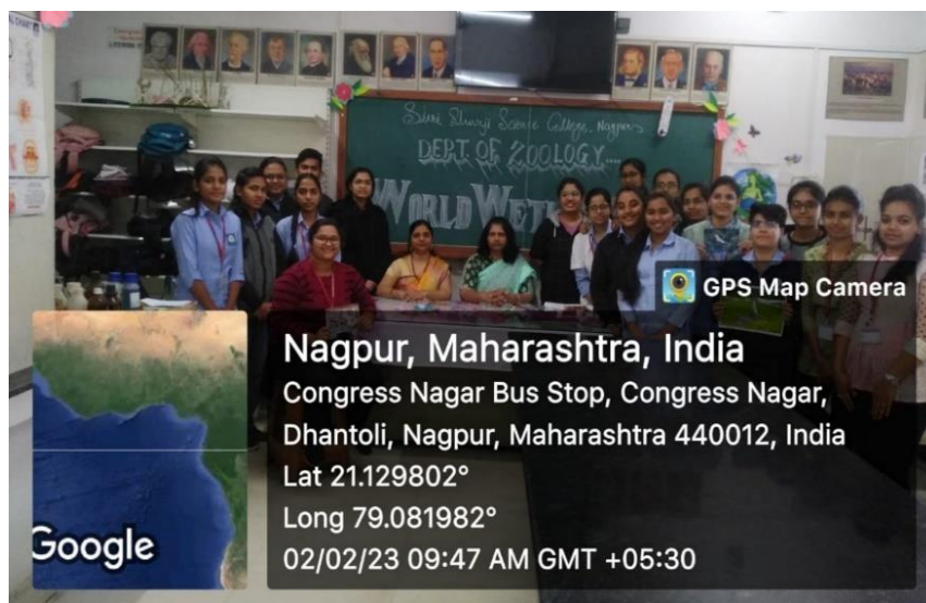
Lecture given on World Wetland Day