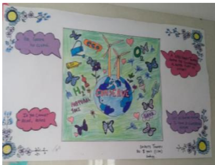
Poster presented by students