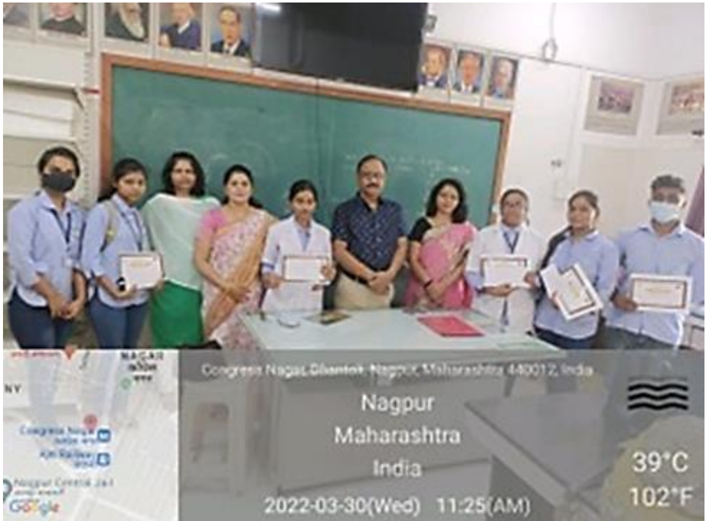
Certificate and cash prize distribution of WET LAND DAY Programme & AIDS DAY Programme in Department Of Zoology in offline class.