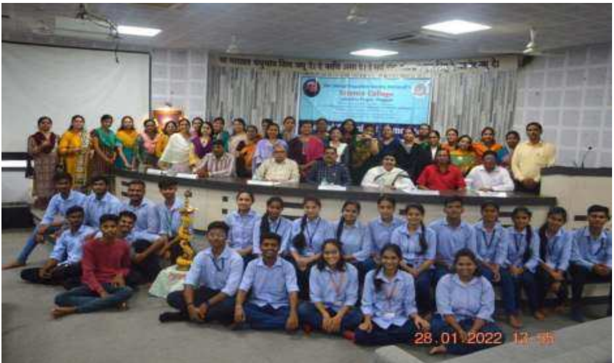
Group photo of the guest lecture organized by ICC entitled, "Laws regulating women safety at workplace (Act-2013)".