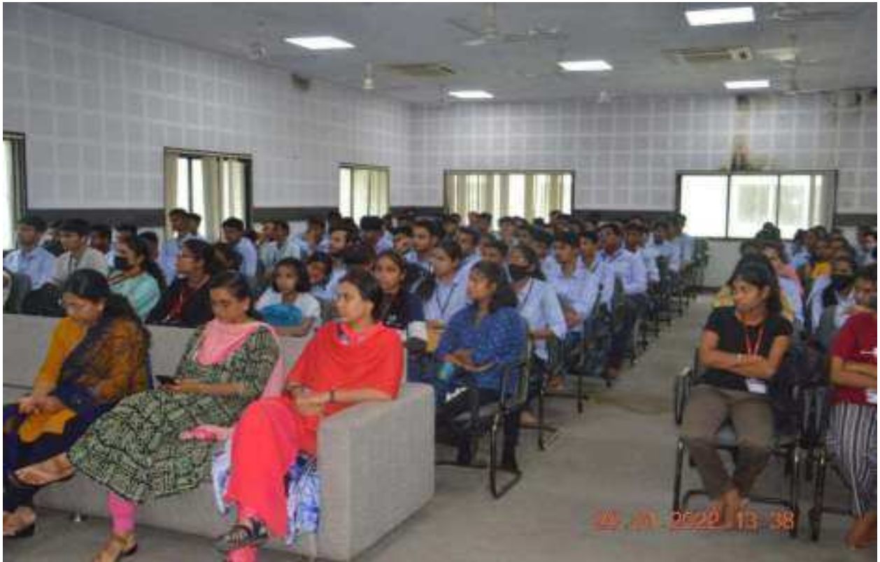
Attendees of the guest lecture organized by ICC entitled, "Laws regulating women safety at workplace (Act-2013)".