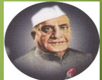
Late Dr Panjabrao alias Bhausaheb Deshmukh, Founder President