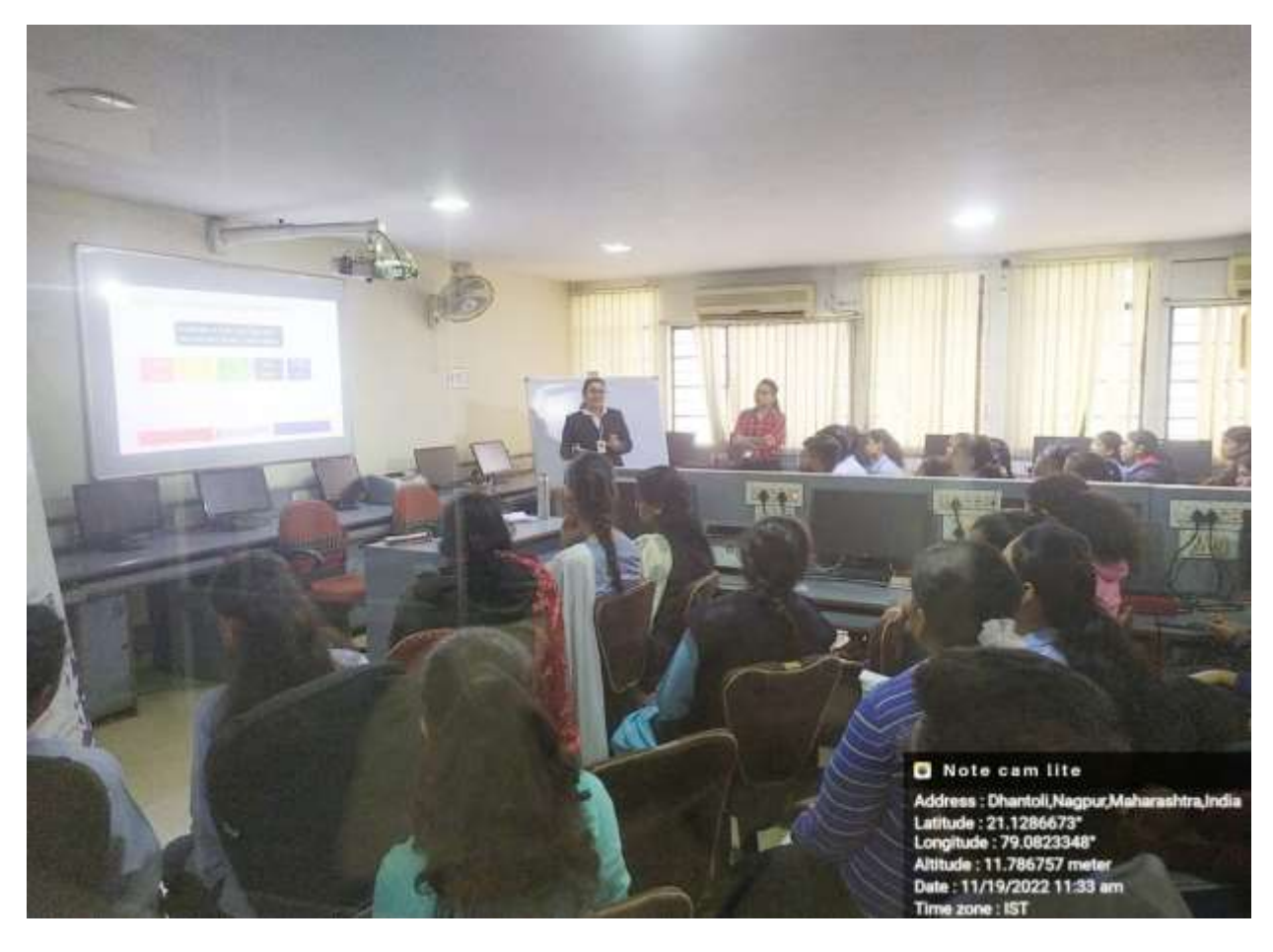
Students Actively participated in Lecture.