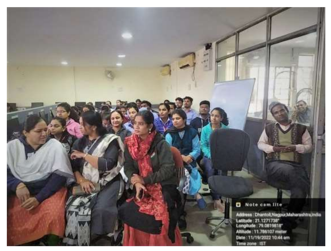
Students and Staff of Computer Science Department .