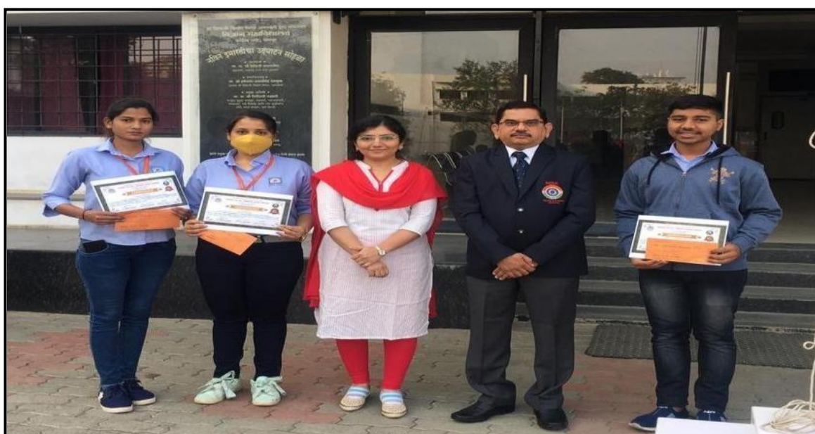
Jingle Competition Winners