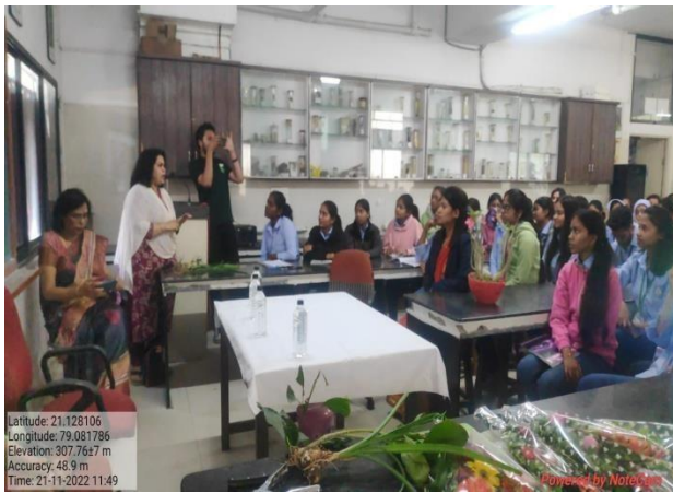
Latitude: 21.128106 Longitude: 79.081796 Elevation: 307.76±7 m Accuracy: 48.9 m Time: 21-11-2022 11:49