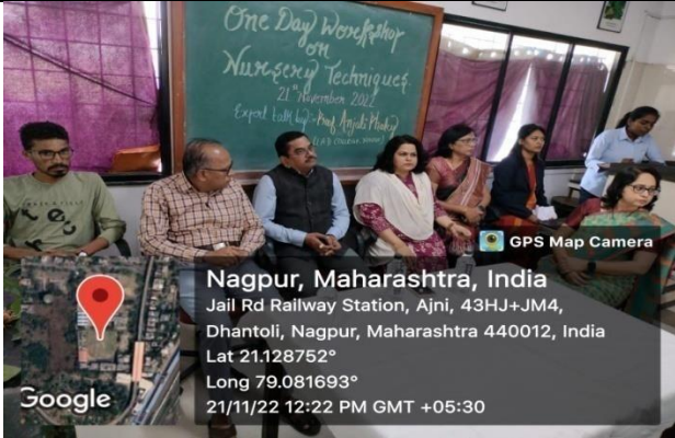
GPS Map Camera Nagpur, Maharashtra, India Jail Rd Railway Station, Ajni, 43HJ+JM4, Dhantoli, Nagpur, Maharashtra 440012, India Lat 21.128752° Long 79.081693° 21/11/22 12:22 PM GMT +05:30