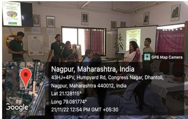
GPS Map Camera Nagpur, Maharashtra, India 43HJ+4PV, Humpyard Rd, Congress Nagar, Dhantoli, Nagpur, Maharashtra 440012, India Lat 21.128115° Long 79.081774° 21/11/22 12:54 PM GMT +05:30