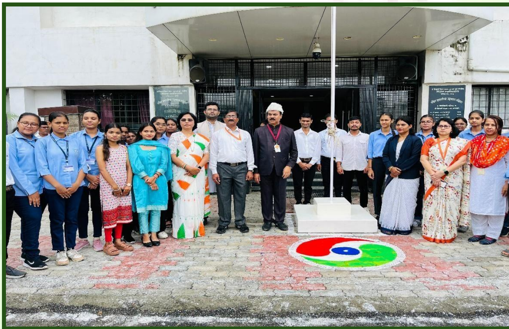
Principal sir along with other faculty members and students of Botany Department