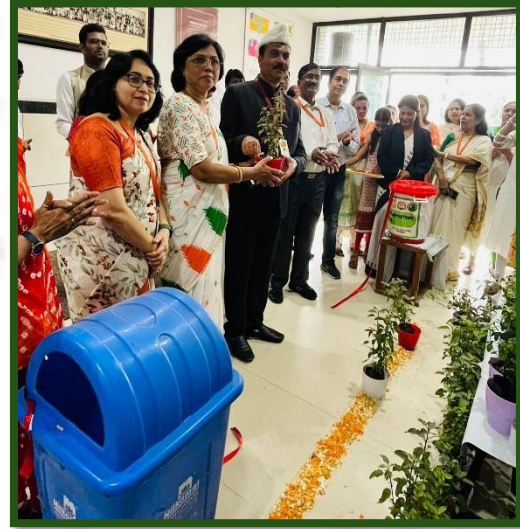
Principal sir inaugurating 'Ek Ped Bhart Maa Ke Naam'