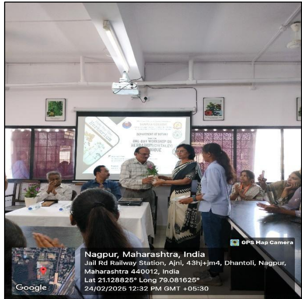
Chief Guest felicitated by Memento and Sapling