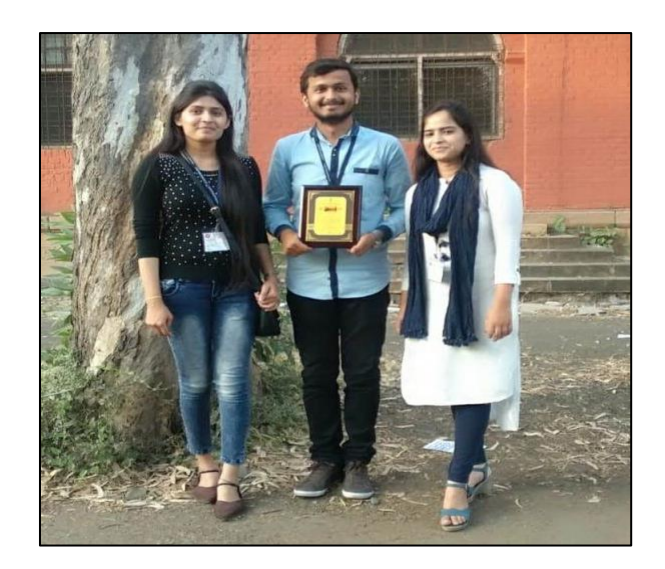
Celebrating excellence! Congratulations to our outstanding students for their remarkable achievements at NSC-2019.