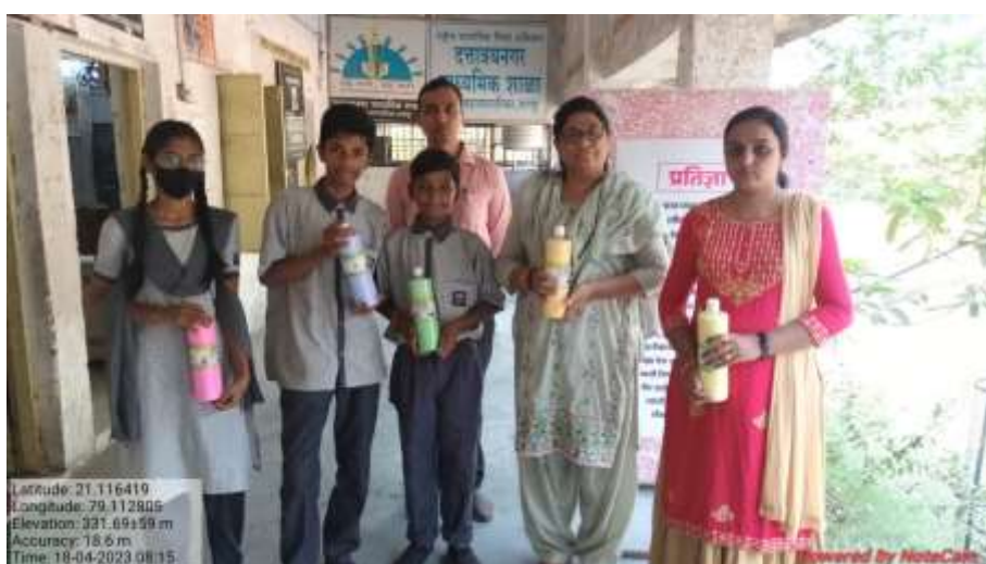
Figure 3- Distribution of Chem Clean Floor Cleaner to NMC School Dattatray Nagar Nagpur