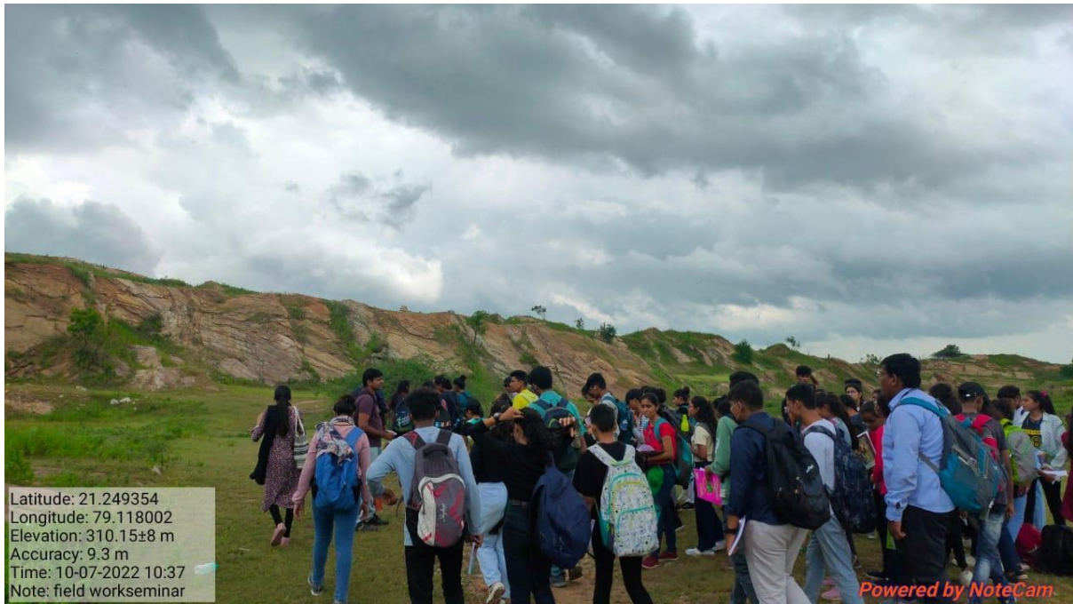
One day field visit to Koradi area near Nagpur with all faculty members and 1 st year students.

Department of Geology arranged 1 st year one day field excursion tour to Koradi (Maharashtra) and nearby areas. The tour was carried out in the presence of 4 faculty members and 84 students were present. Many samples were collected by students for the department and personal collection. field excursions were completed enriching students' knowledge regarding field geology. Students have submitted their respective Geological Excursion Reports with necessary field samples and photographs.