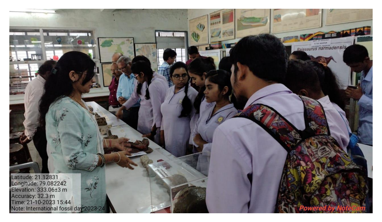
Geoscientist from Geological Survey of India explaining about the fossils to the UG students of Mohta Science College, Nagpur.