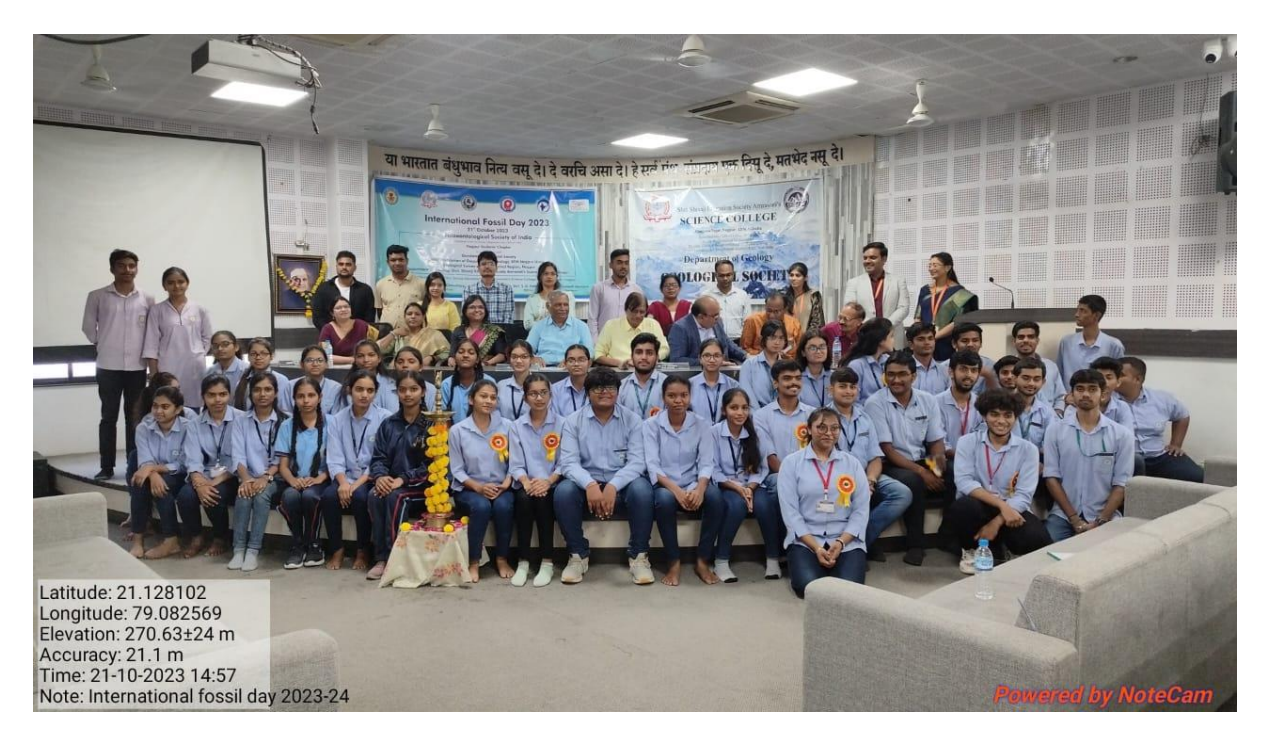
Group photos were taken with guests after the successful completion of the program