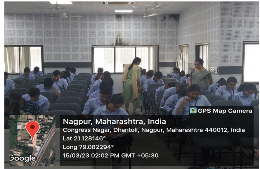
Quiz competition on “English for Competitive Exams”