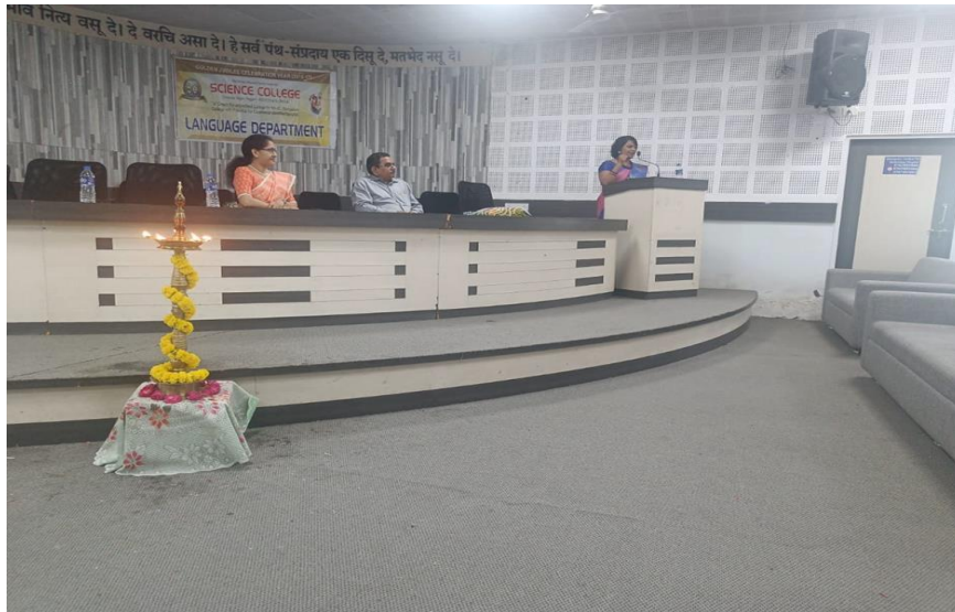
Guest Lecture on “Attaining Peace of Mind: A Key to Success”