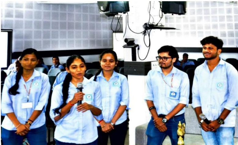
Students Active Participation On Hindi Diwas