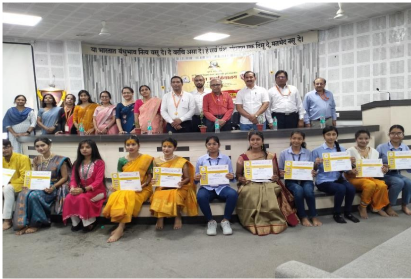
Marathi Bhasha Diwas