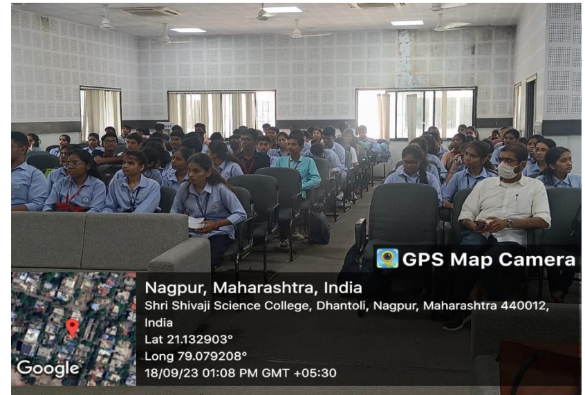
Students active participation in Guest lecture