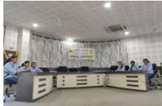
Elocution competition on 'Freedom of Speech: a Boon or a Bane'