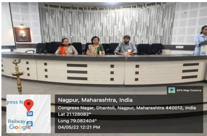
Elocution Competition “Are We Really Independent?”