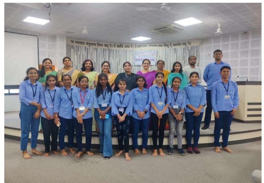
Faculty with Guest and students