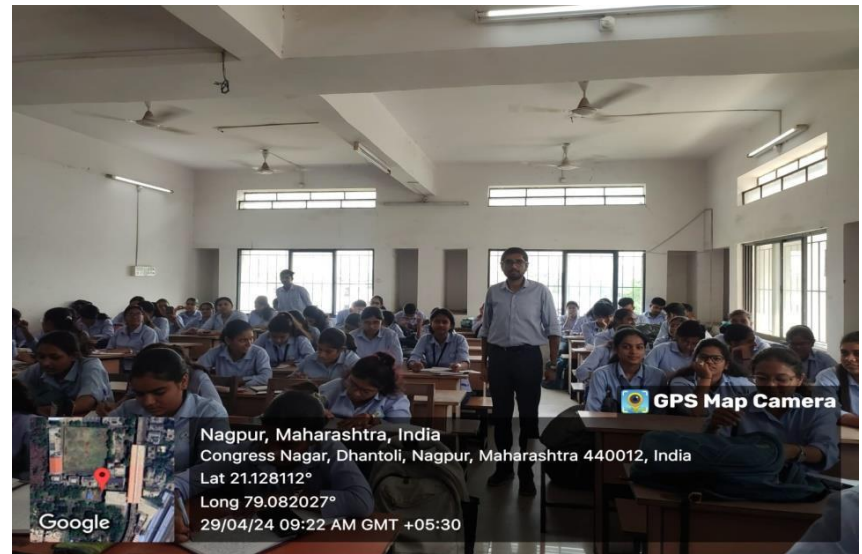
Essay competition on “Indian Education System”.