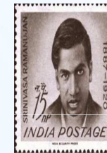
S. Ramanujan (1887-1920)