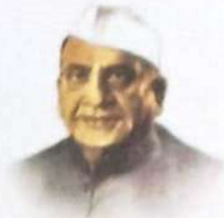
Dr. Panjabrao alias Bhausaheb Deshmukh Founder President