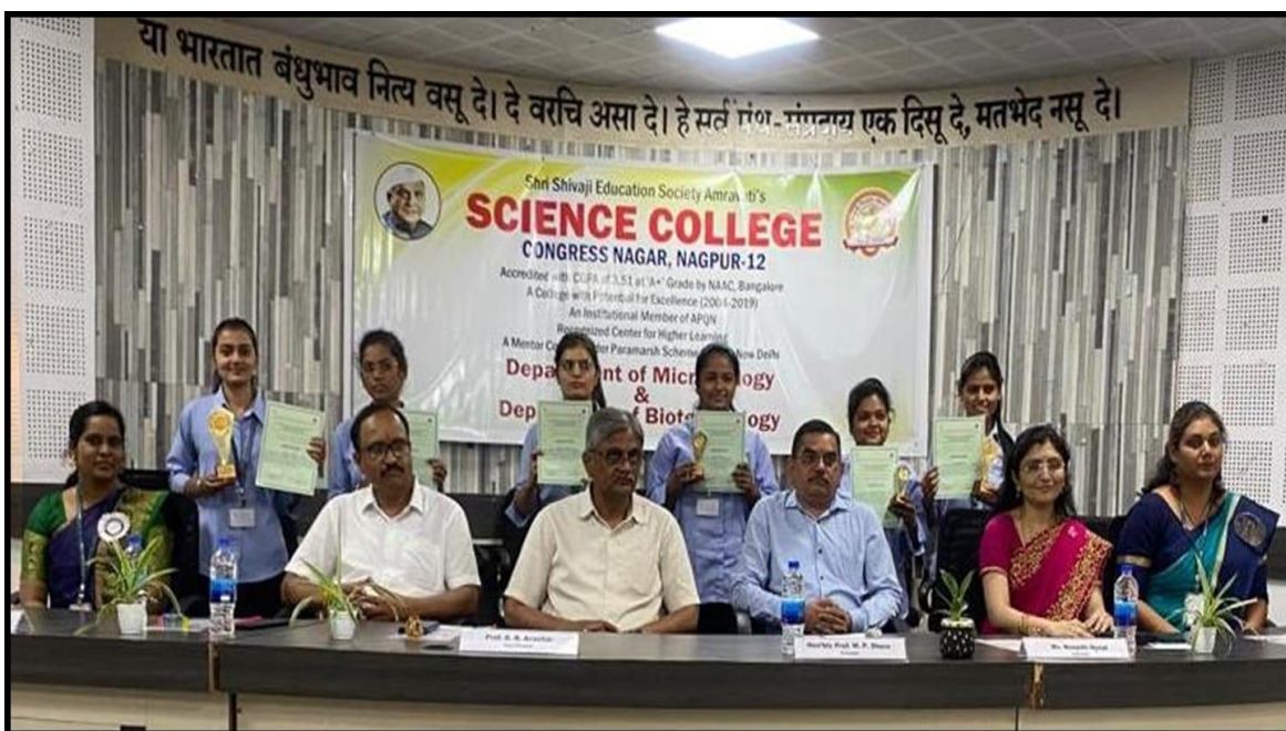
Prize Distribution for Calender Making Activity