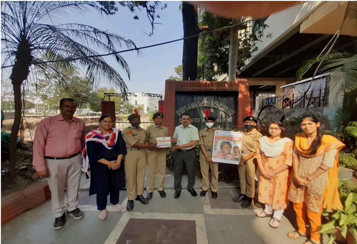
Photograph on Communal Harmony Campaign Week and Flag Day 2021.