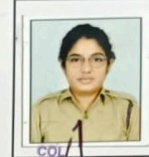
COL COMMANDING OFFICER 20 MAH BN NCC, MAHARASHTRA