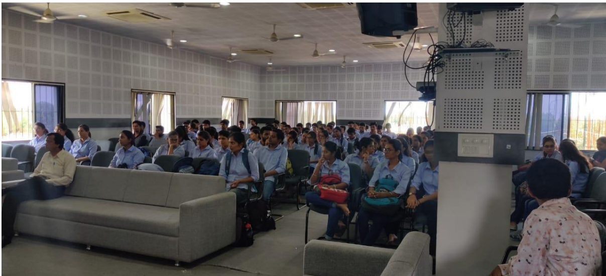
Students listening the Speaker