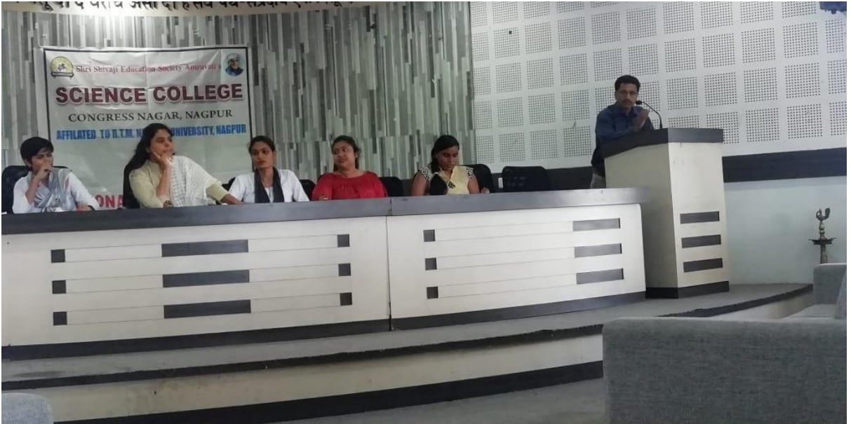
NSS Programme Officer giving concluding Remark