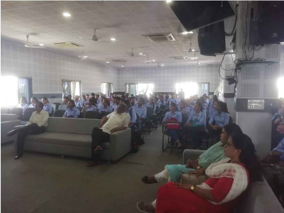
Faculty and Students listening the Guest Speaker