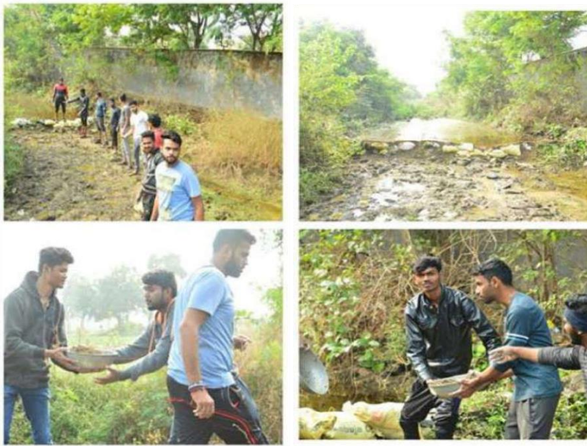
NSS volunteers constructed a small canal wall of rock and sand