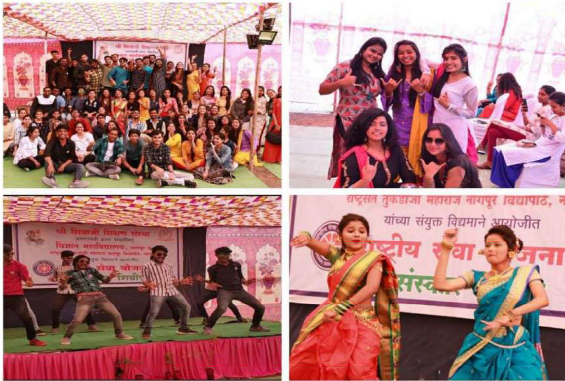
NSS volunteers performing in the cultural event