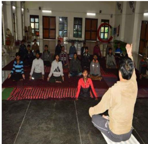
NSS volunteers performing Yoga and the Yoga Instructor instructing students