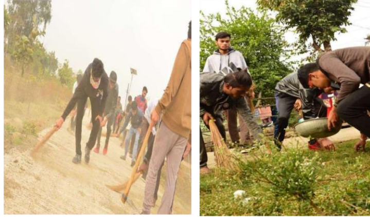
NSS volunteers cleaning the village