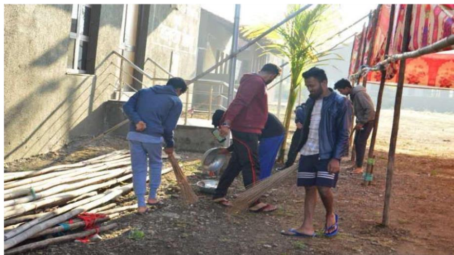
NSS volunteers cleaning the Camp campus