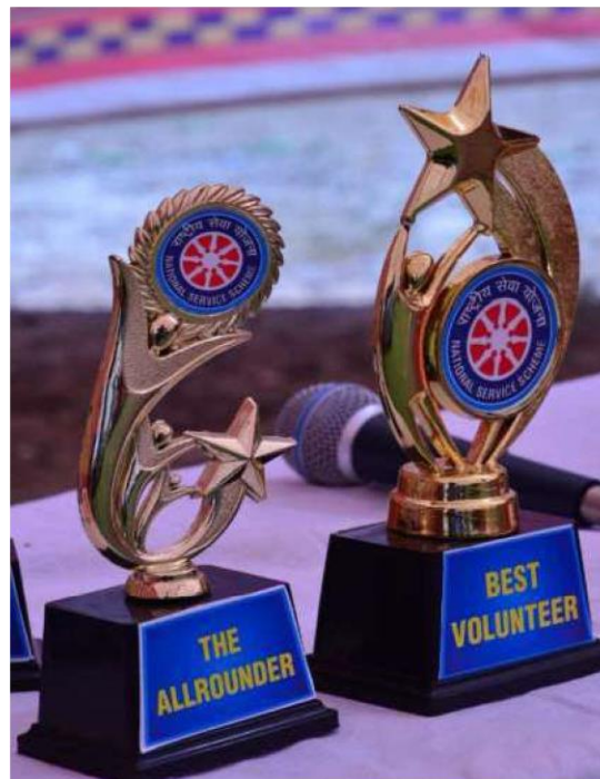
Trophies of Best Allrounder and Best Volunteer during the NSS Camp