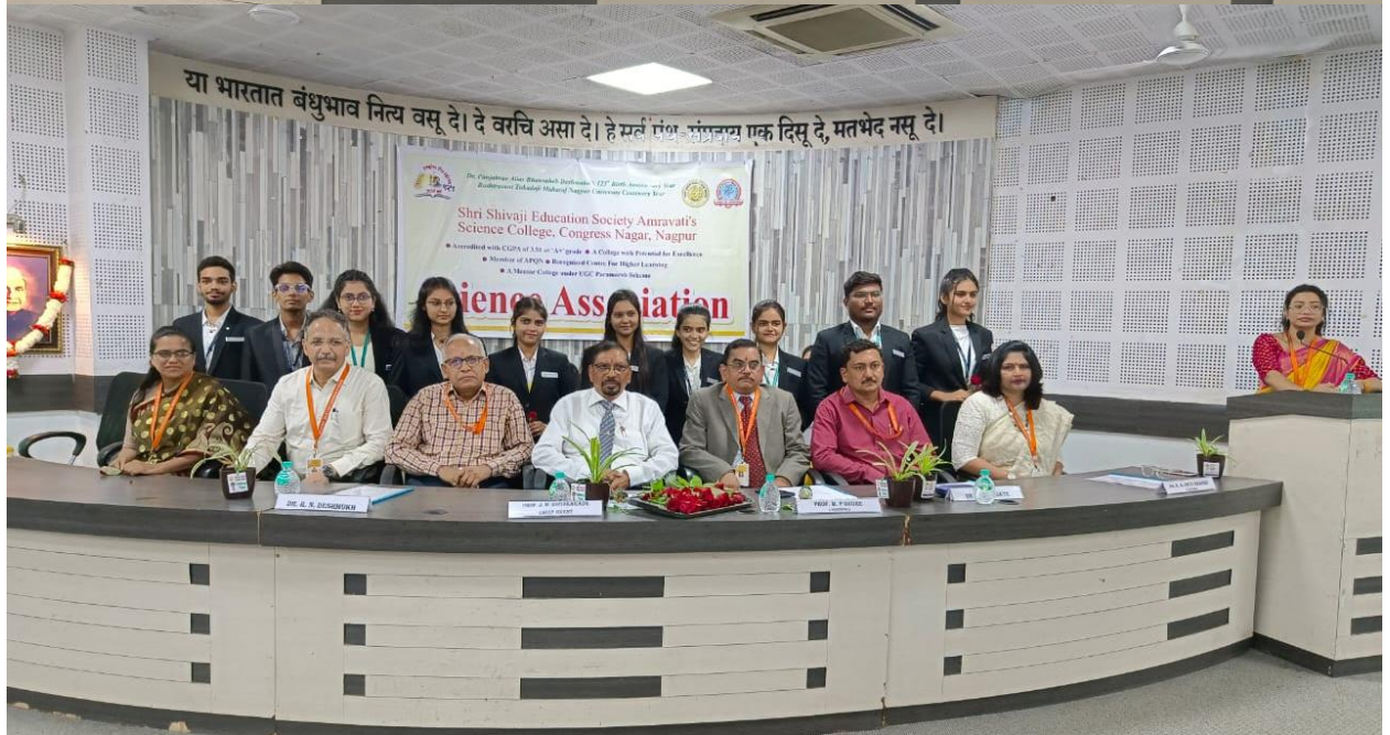
Inauguration of the Physics Society at Shri Shivaji Science College-Nagpur