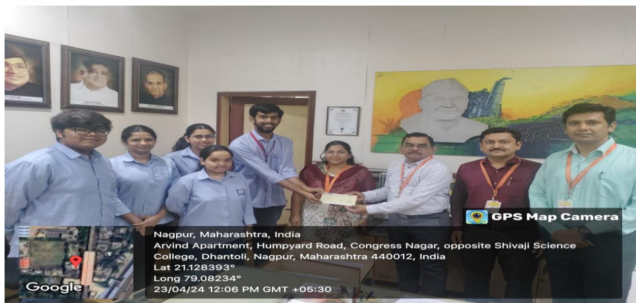
UG & PG Students from Physics Department received financial support for participation in UPTA