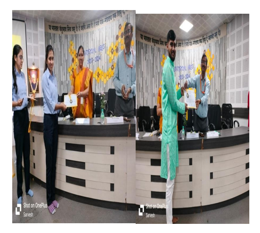
Wnners of Presentation Competition Receving medal and certificate