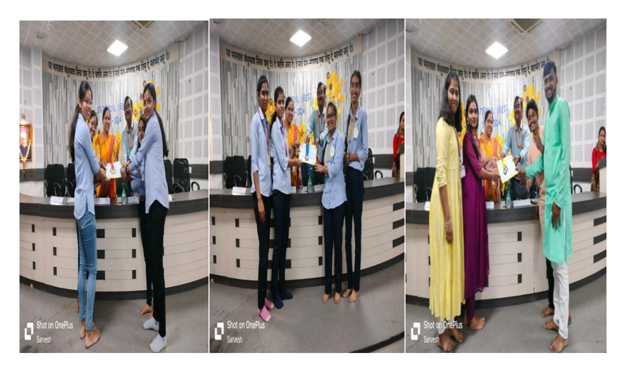
Winners of Quiz Competition (Team Alpha, Theeta, Gamma) Receving medal and certificate