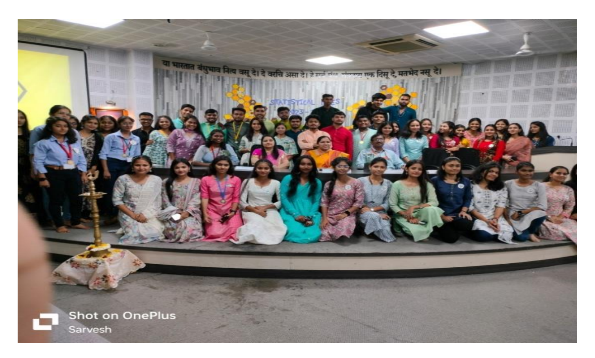
All Faculty members of Statistics Department with the Organizing team