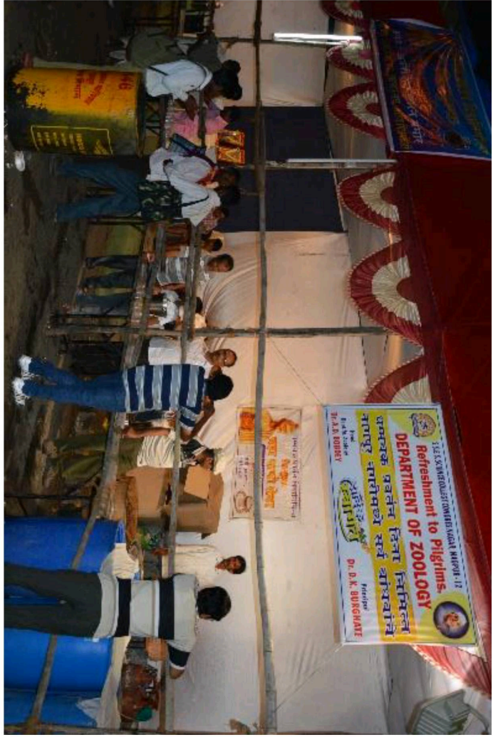
Distribution of Tea and Snacks to Pilgrims