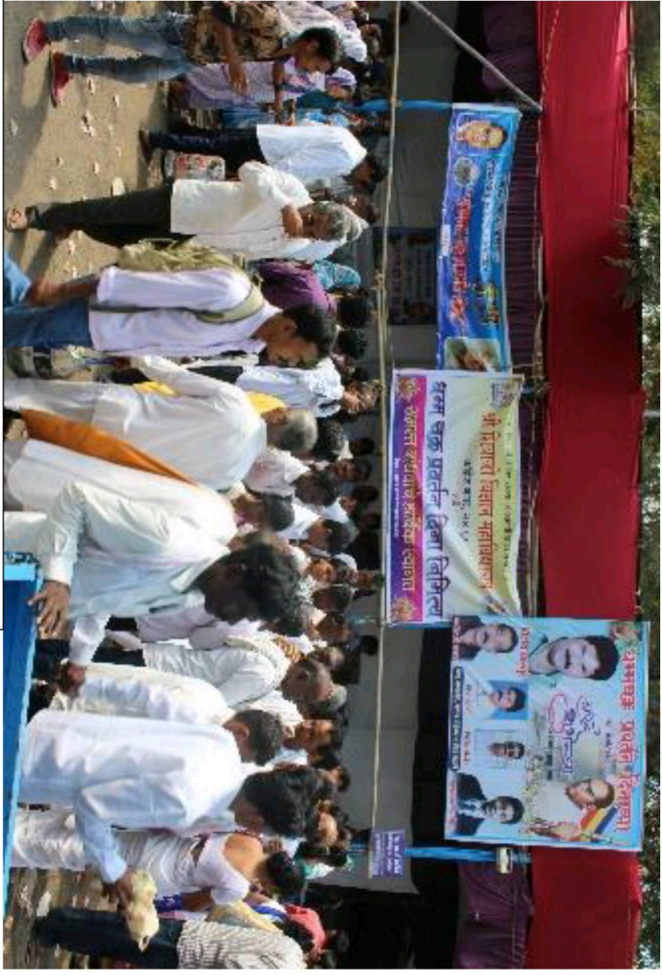
DISTRIBUTION OF TEA AND SNACKS TO THE PILGRIMS OF DIKSHA BHOOMI AT AJNI RAILWAY STATION