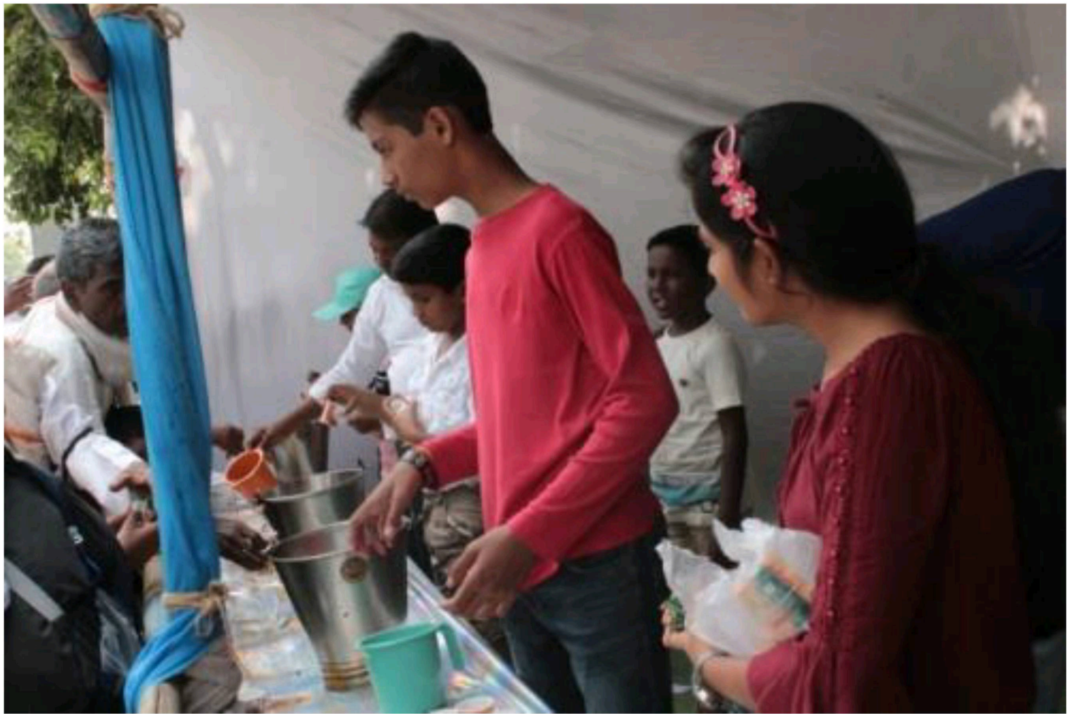
DISTRIBUTION OF TEA AND SNACKS TO THE PILGRIMS OF DIKSHA BHOOMI AT AJNI RAILWAY STATION