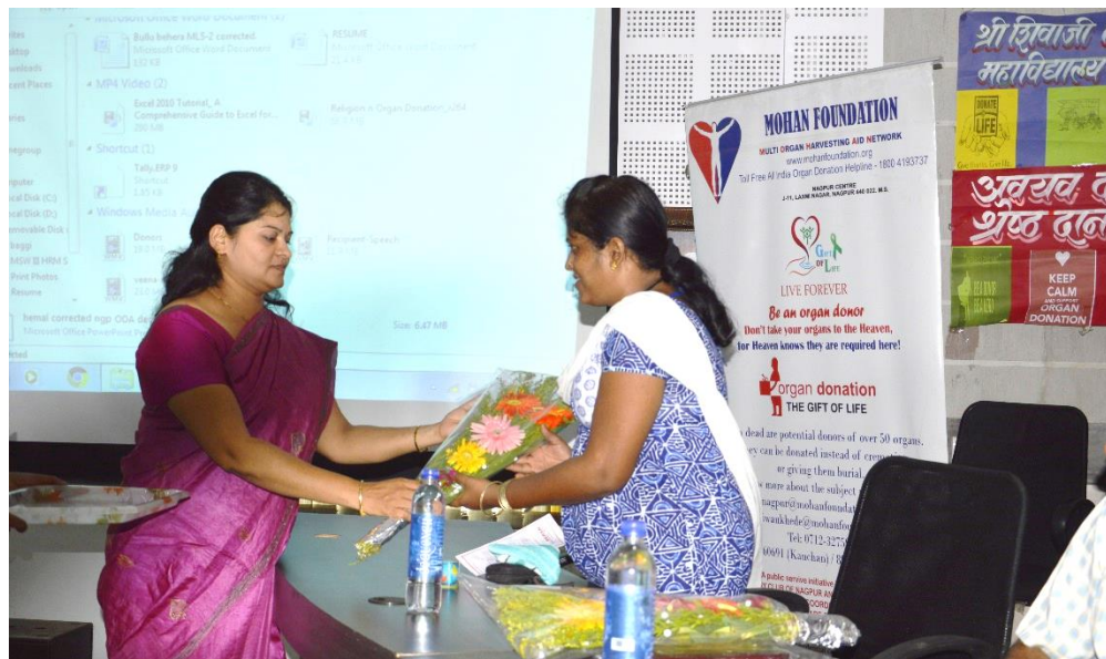
Welcoming Of Guest