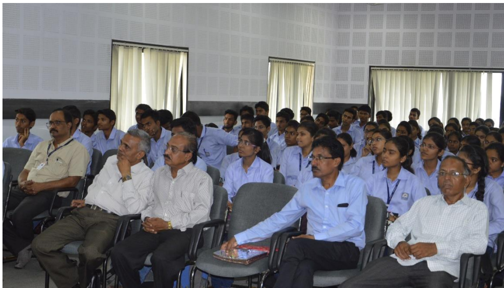
Interactive Session: A Q&A session to address students' queries and concerns.