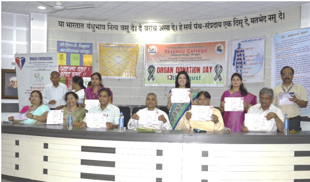
The pledge consent form given to students and teachers.