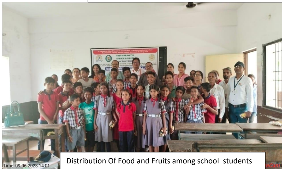
Distribution Of Food and Fruits among school students