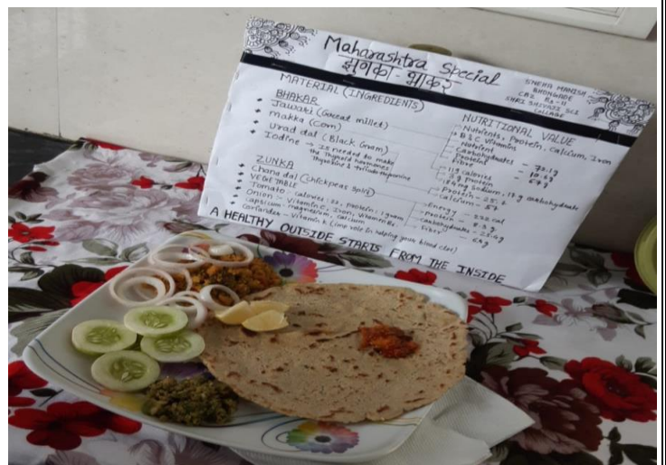
Healthy Dish Competition