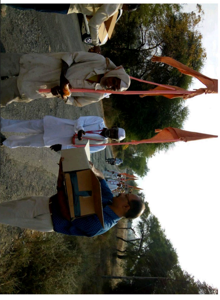
DISTRIBUTION OF SNACKS TO WALKING PILGRIMS OF SHEGAON BY MOBILE VAN