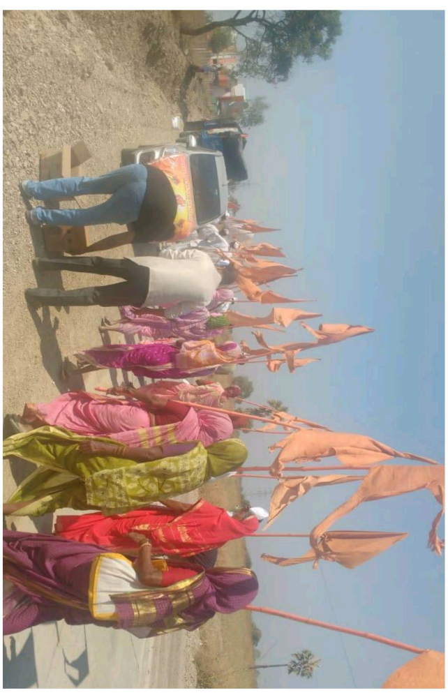
DISTRIBUTION OF SNACKS TO THE PILGRIMS OF SHEGAO BY MOBILE VAN