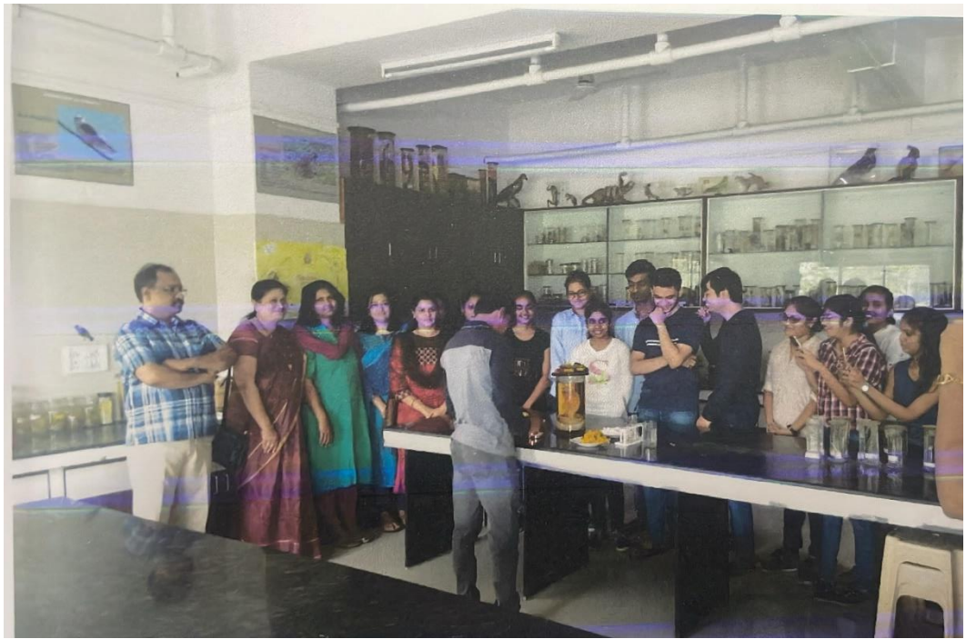
Celebration of snake day