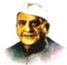
Dr. Panjabrao alias Bhausaheb Deshmukh Founder President