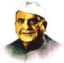
Dr. Panjabrao alias Bhausaheb Deshmukh Founder President