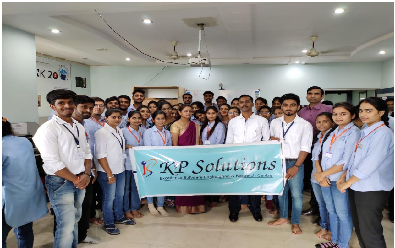
Students of Computer Science Department visited the K.P. Solution Nagpur