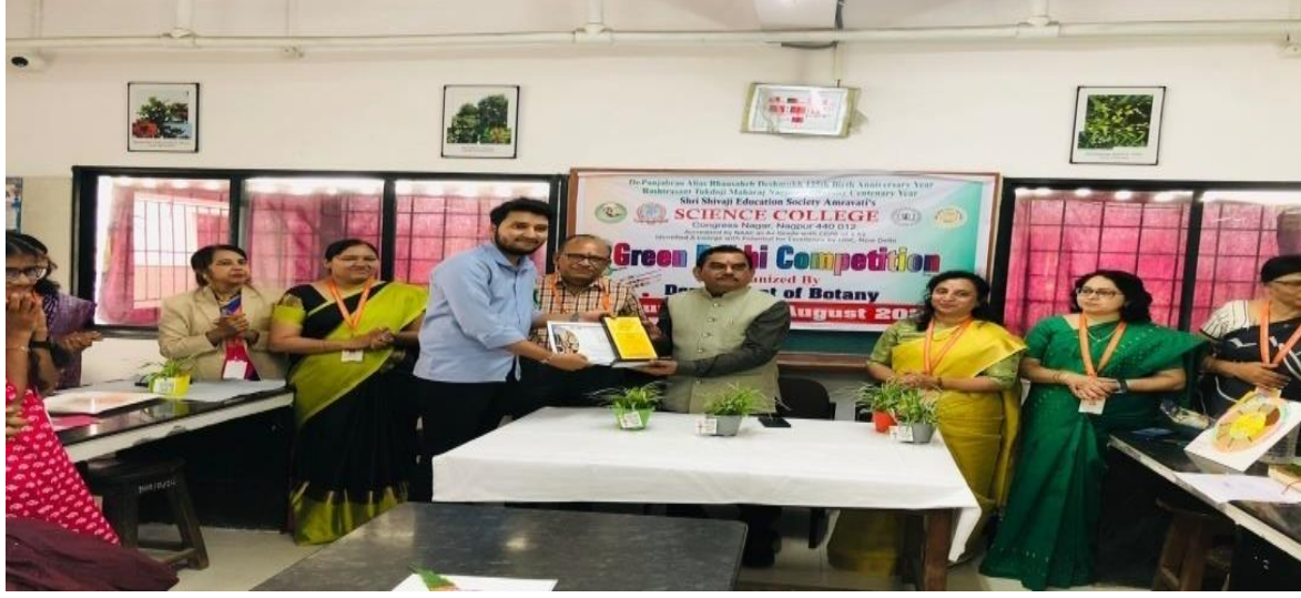
2) First winner of Green Rakhi Competition