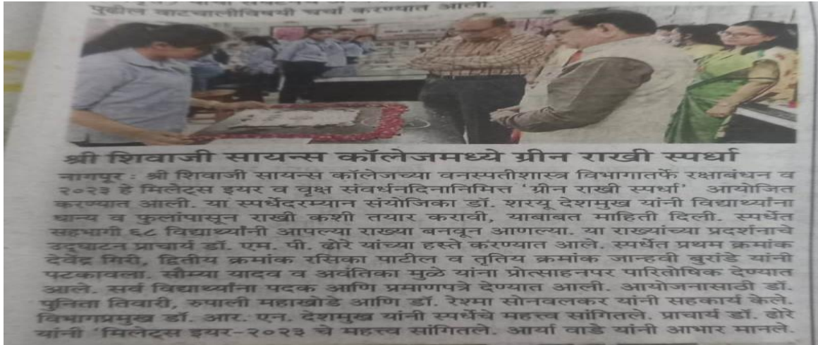
3) Local News Paper Maharashtra Times News