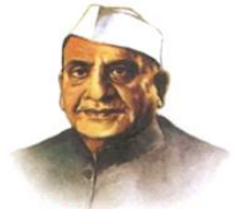
Dr. Panjabrao alias Bhausaheb Deshmukh Founder President