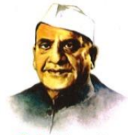
Dr. Panjabrao alias Bhausaheb Deshmukh Founder President