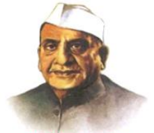
Dr. Panjabrao alias Bhausaheb Deshmukh Founder President