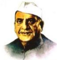
Dr. Panjabrao alias Bhausaheb Deshmukh Founder President