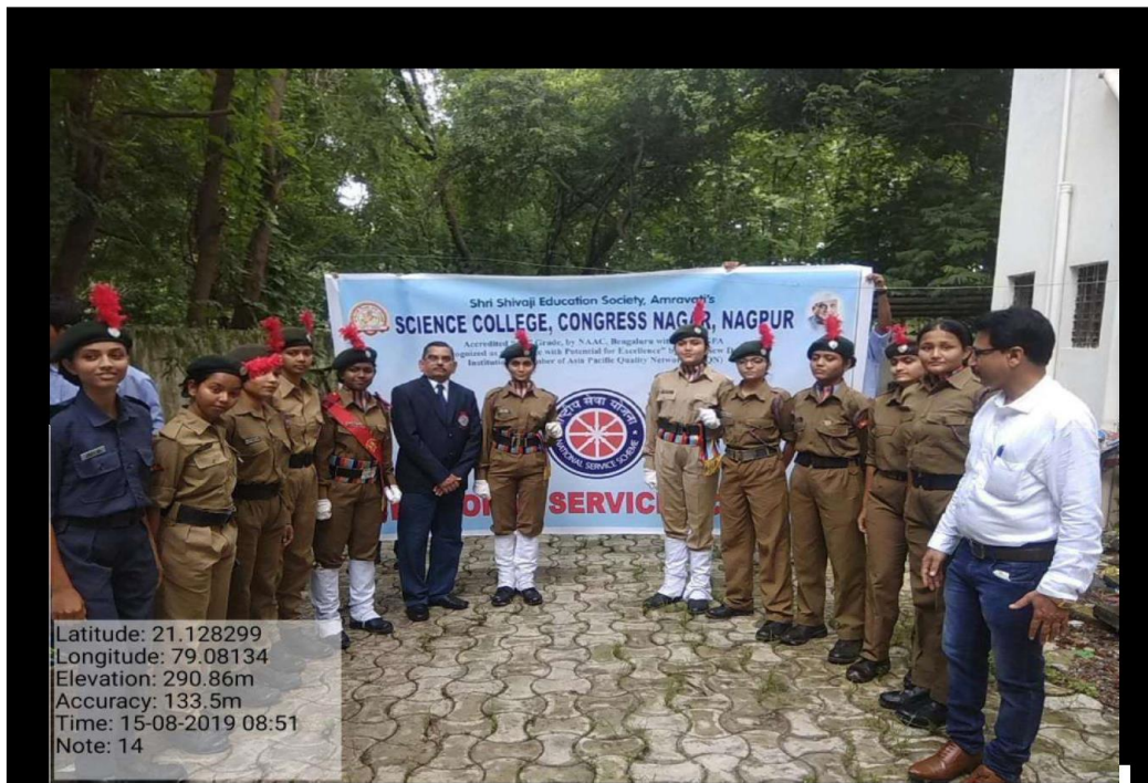
Fig. 3 – Tree Plantation