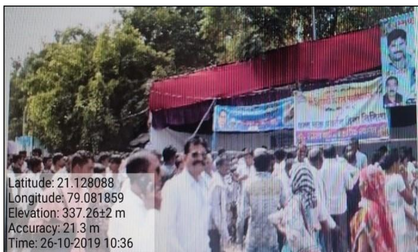
Fig. -2 Distribution Of Tea And Snacks To The Pilgrims Of Dikshabhoomi Infront of College Stall.