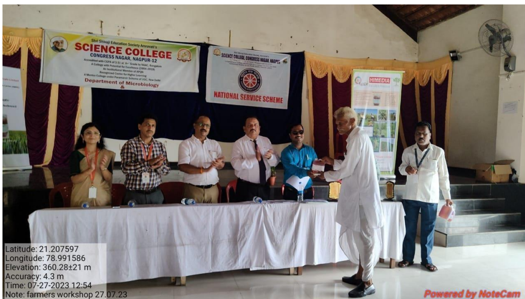
Fig. 8 -Distribution of liquid Biofertilizers (Soil Rejuvenator) to Farmers at Fetri