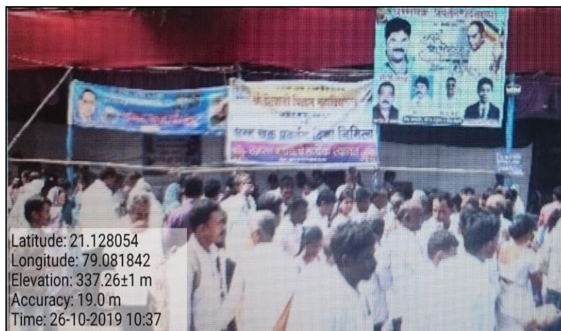
Fig. -1 Distribution Of Tea And Snacks To The Pilgrims Of Dikshabhoomi