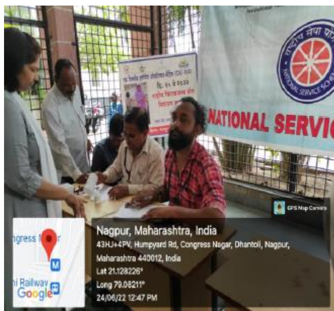
Fig. 7 – Peoples from local Area participation