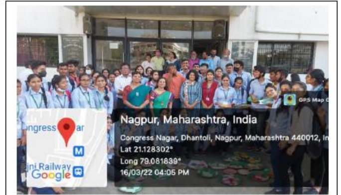
Group photo with Ecofriendly Holi Colours