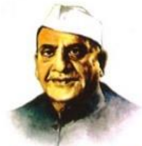
Dr. Panjabrao alias Bhausaheb Deshmukh Founder President