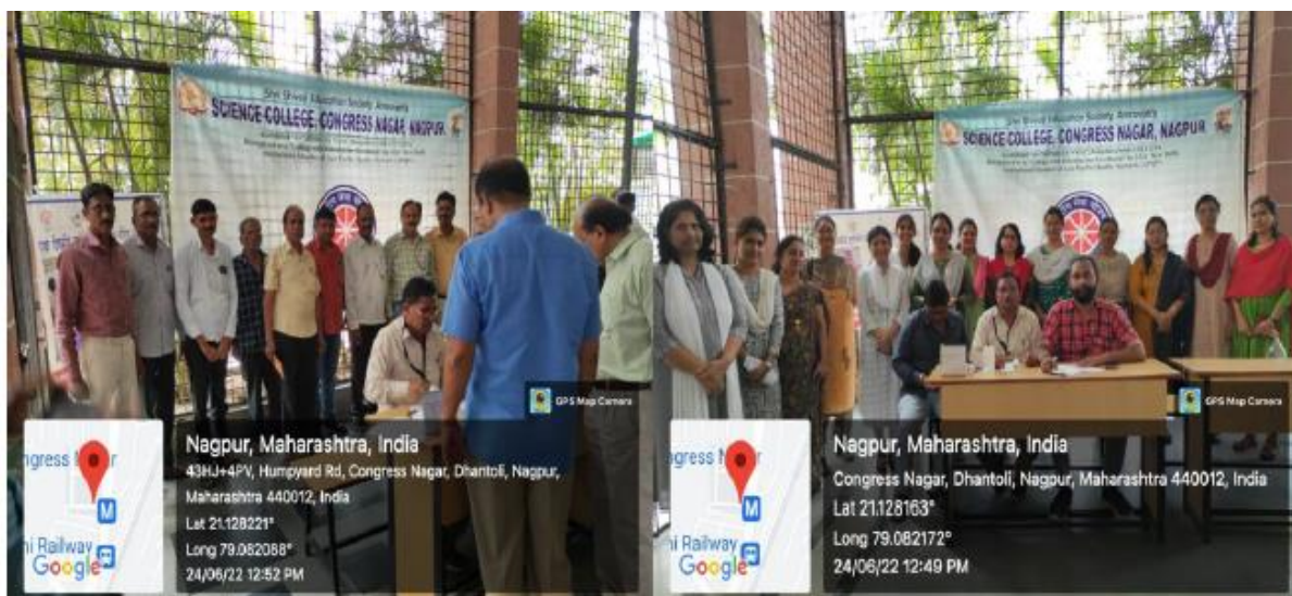
Fig. 5 & 6 – Students and People from local Area participation