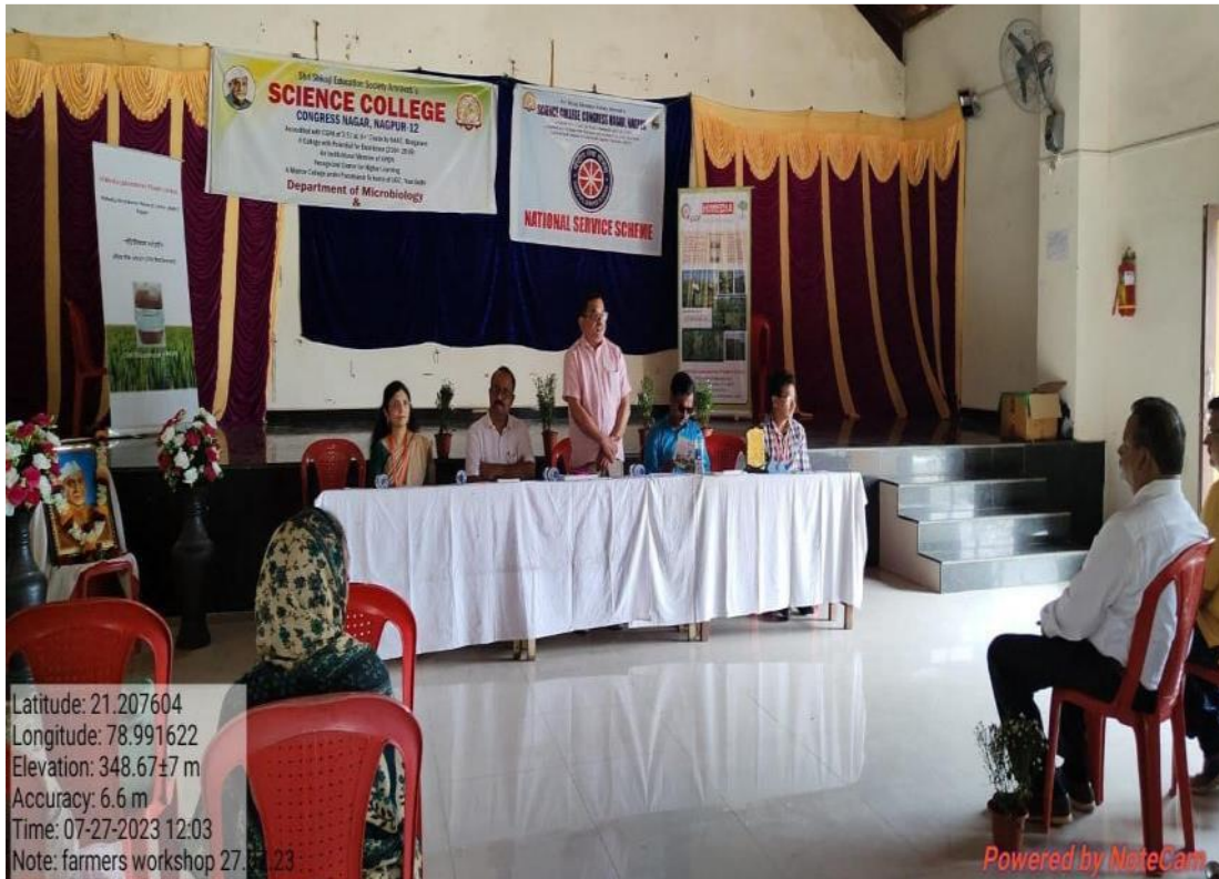
Fig 8 – Introductory Speech