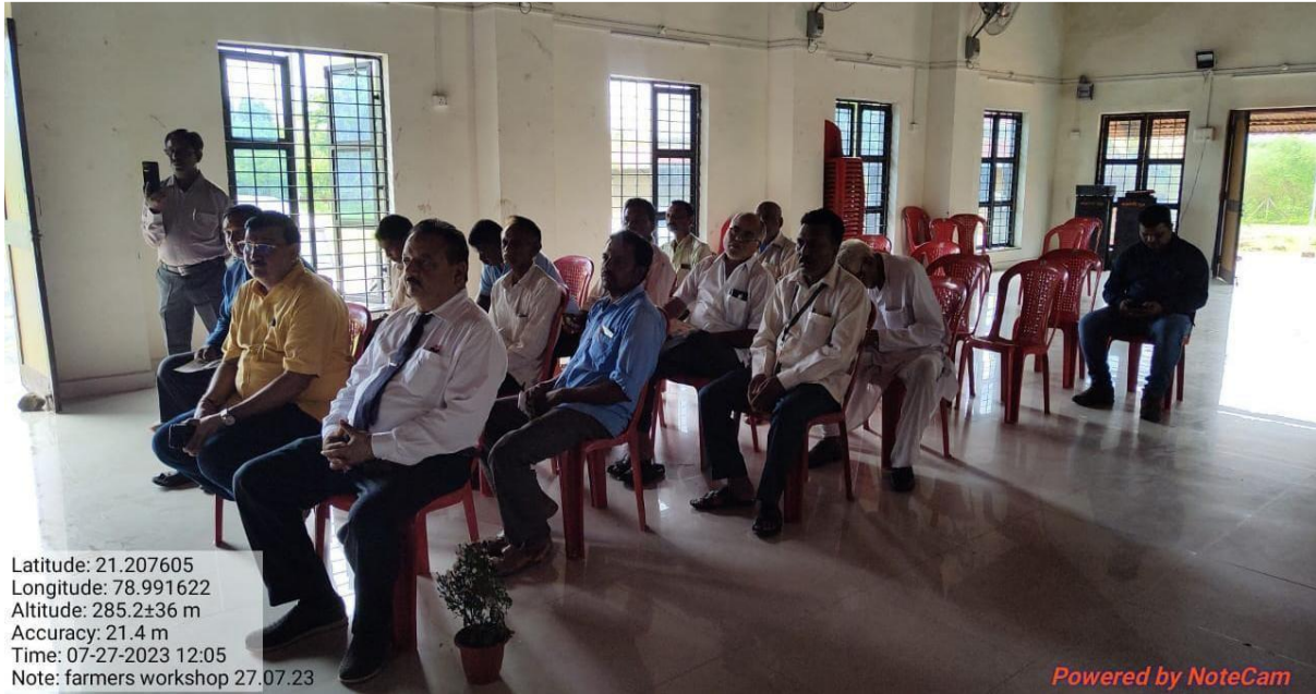
Fig 9 - Farmers attending Workshop at Fetri