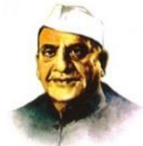
Dr. Panjabrao alias Bhausaheb Deshmukh Founder President