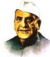
Dr. Panjabrao alias Bhausaheb Deshmukh Founder President