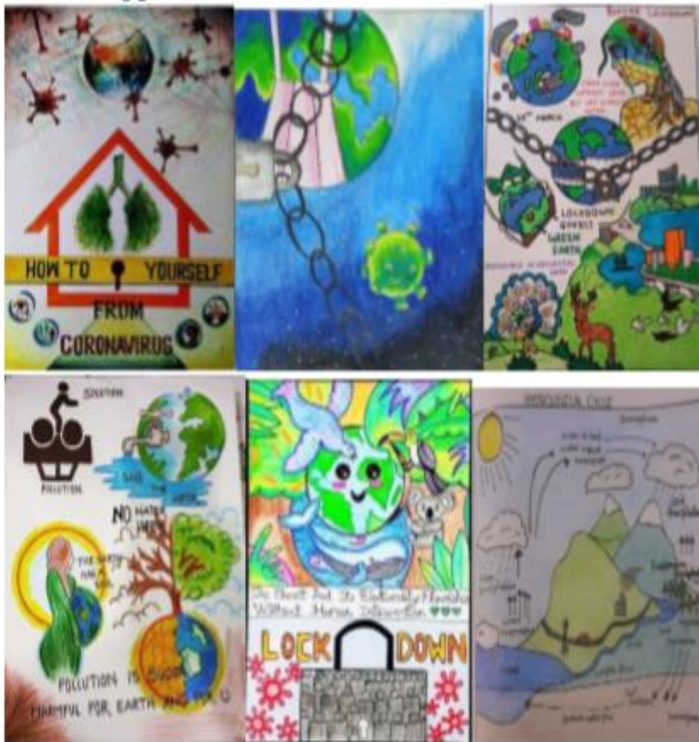
Poster Made By Students