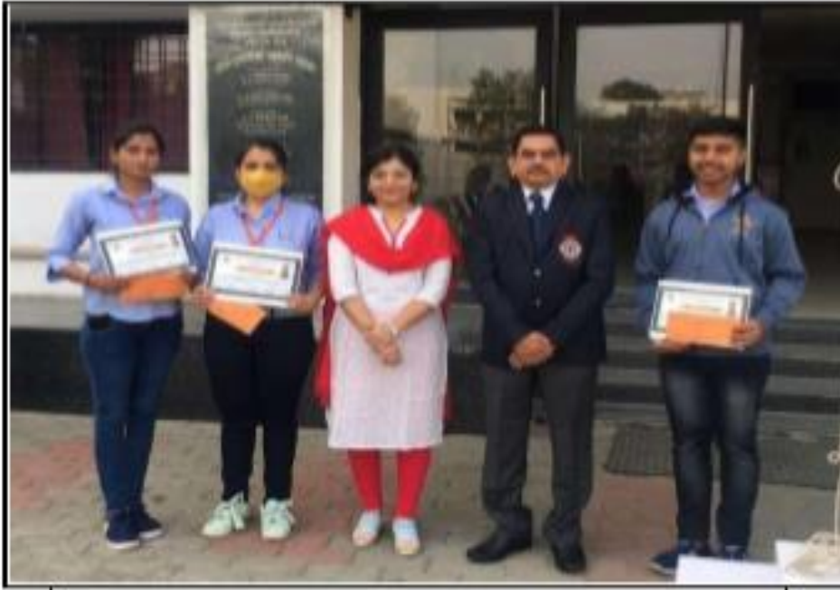
Winners of Jingle competition Dt. 27/12/2020