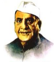
Dr. Panjabrao alias Bhausaheb Deshmukh Founder President