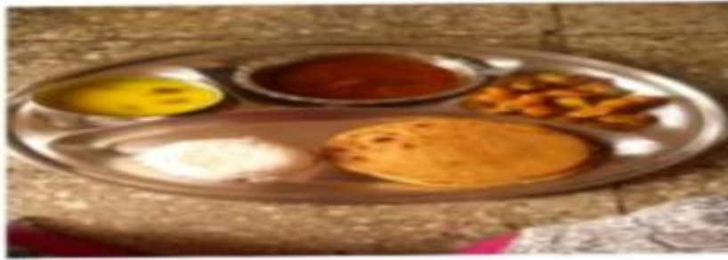
Nutritional Dish Presented By Student