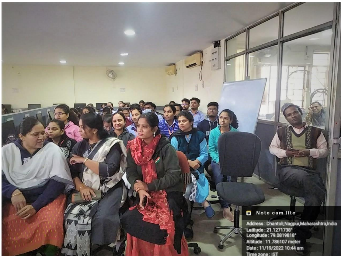
Students and Staff of Computer Science Department .