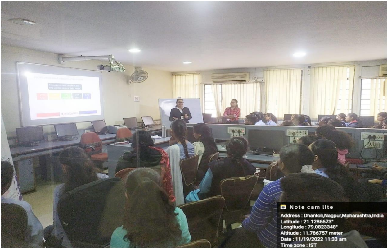
Students Actively participated in Lecture.